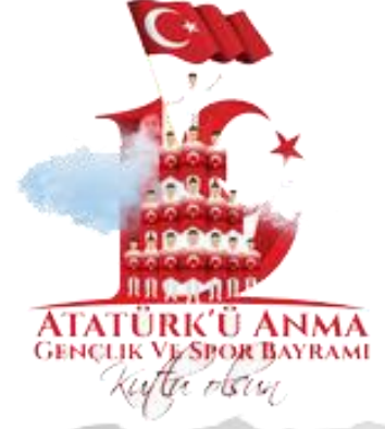
Youth and Sports Day